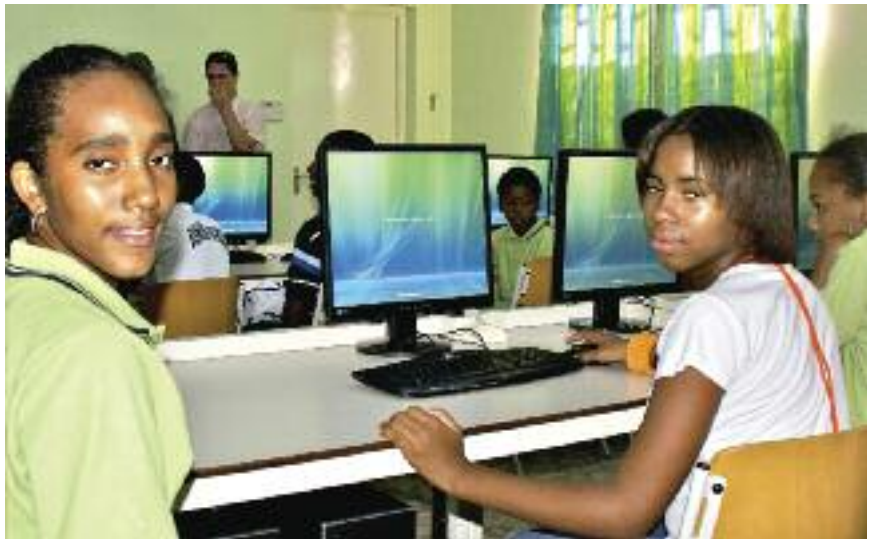
With support from the Dutch Ministry for Youth and Family, the computer lab was totally upgraded. Computers are one of the most popular activities at the center.

With the grant from the RSC Jong Bonaire was able to install 26 new computers along with an upgraded server for the system. Electricity for the equipment was also upgraded along with new erko and a new roof for the computer lab. The computer lab is one of the most popular activities at Jong Bonaire and now the facility can better meet the needs of our members but also other groups in the community who need to rent such a facility for training.