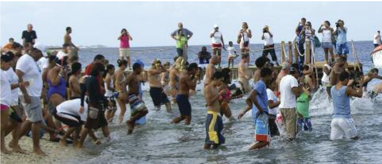
Below: More that 330 people joined the 9th Annal Swim to Klein Bonaire this year. The Jong Bonaire fundraising event is the start of Regatta Week each year.