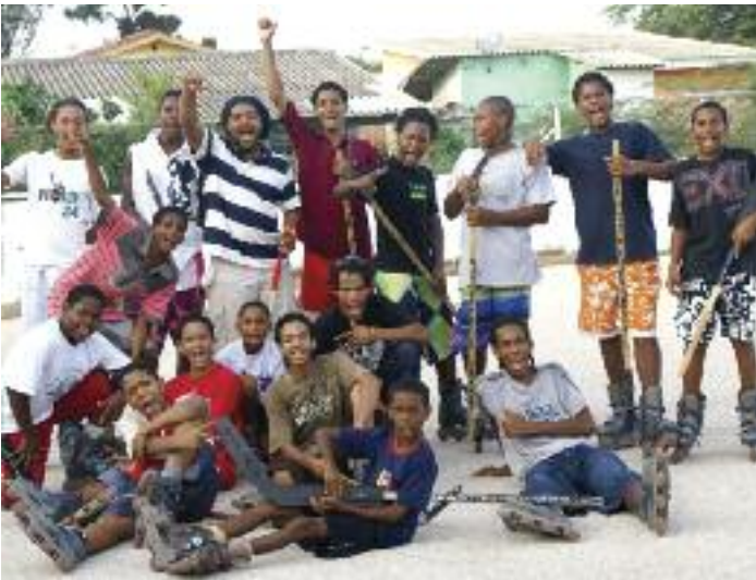
Above: Rollerhockey continues to be a popular activity with several competitions held in 2009, one of them against former members.