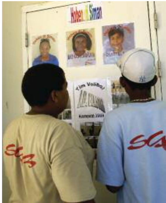
Right: teens check out who the Hoben di Siman (Youth of the Week) are.