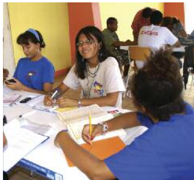
Left: Help with homework is an important part of the afternoon. Teachers and youth leaders are on hand during the required hour of study.