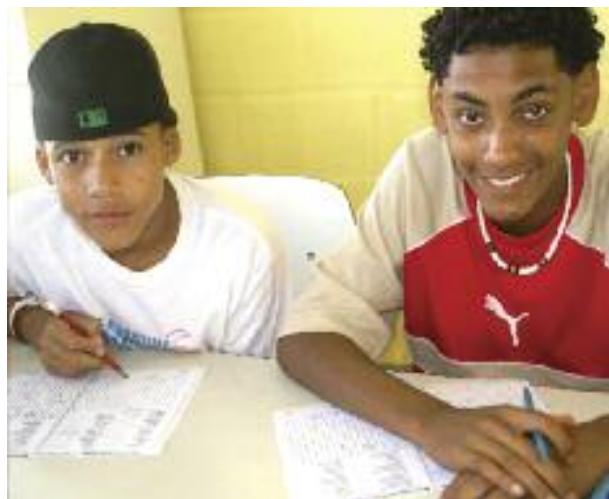
Below: For those without homework, there are brain games and puzzles for them to work on so they don't disturb the others.